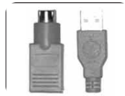
Fig. 1b. Connection Ports