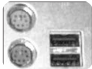
Fig. 1a. System Ports